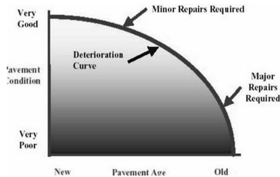
Figure (1.0): General Pavement Deterioration Curve

Figure (1.0) shows a generic deterioration curve and illustrates how the overall condition of the pavement changes as it ages. When first built, the pavement is hopefully in very good condition. Typically, the condition slowly decreases in the first years of service from very good to good condition. As the pavement approaches the end of its service life, the rate of deterioration accelerates.